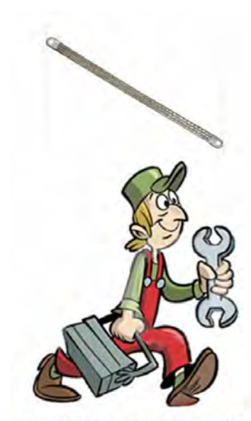
copywrite Frisco illustrationsOf.com/89401